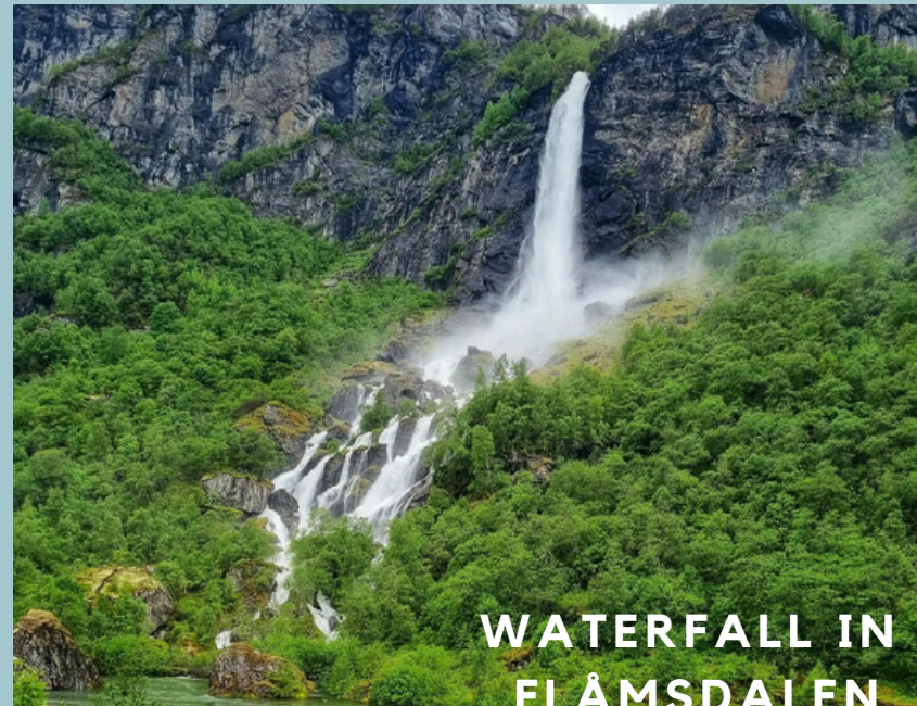
WATERFALL IN FLÅMSDALEN